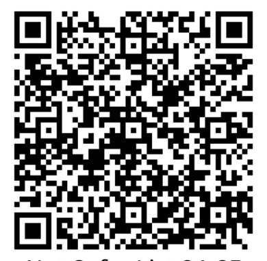
Nut Safer List 24-25